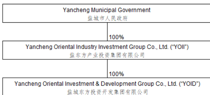
Exhibit 1. Shareholding chart as of 31 March 2026

Source: Company information, CCXAP research