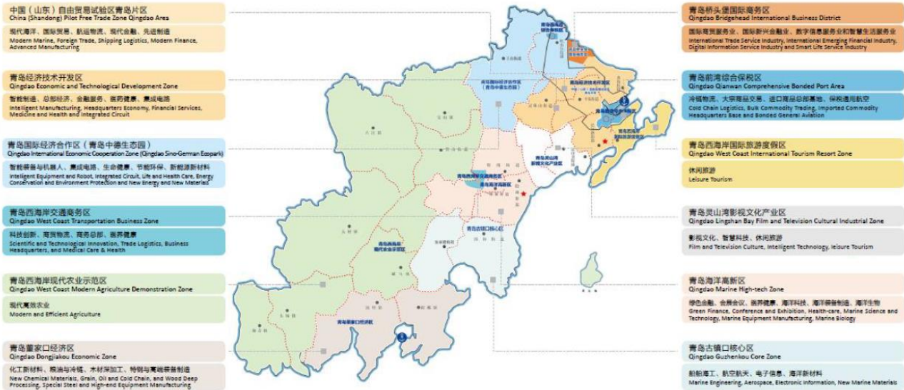
Exhibit 7. Key functional areas of the QDWC New Area