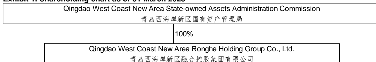
Exhibit 1. Shareholding chart as of 31 March 2023