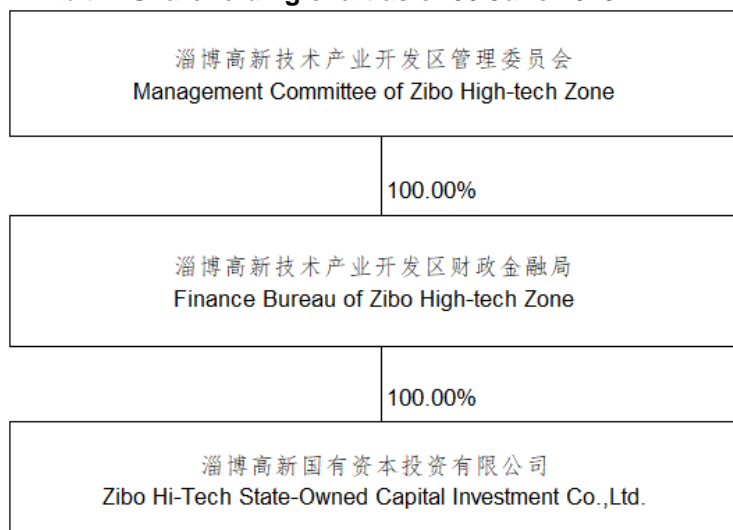
Exhibit 1. Shareholding chart as of 30 June 2023

Source: Company information, CCXAP research