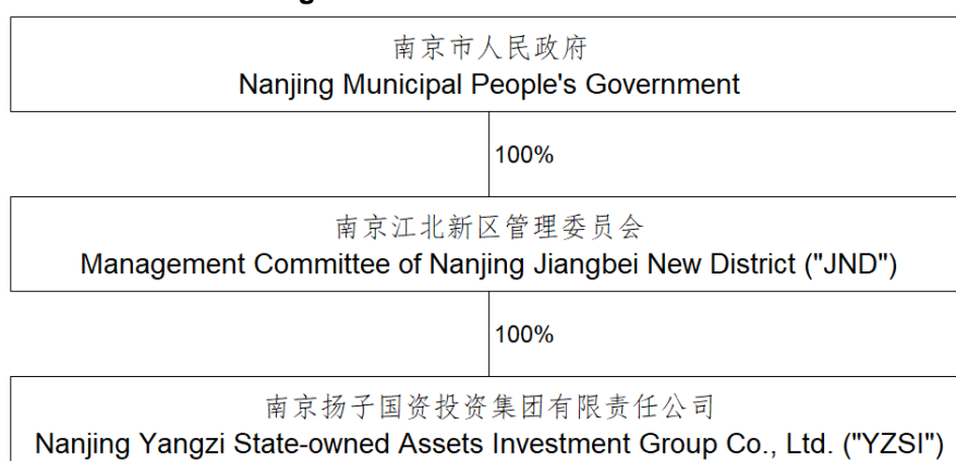
Exhibit 3. Shareholding chart as of 31 March 2024