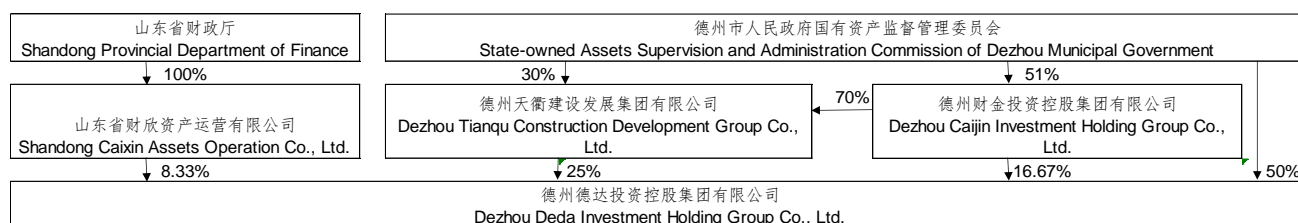
Exhibit 3. Shareholding as of 31 March 2024

Source: Company information, CCXAP research