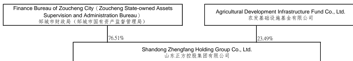
Exhibit 1. Shareholding chart as of 31 December 2022