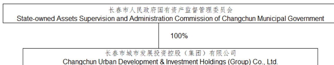
Exhibit 1. Shareholding chart as of 31 March 2025