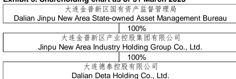
Exhibit 3. Shareholding chart as of 31 March 2023

Source: Company information, CCXAP research