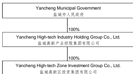
Exhibit 1. Shareholding chart as of 30 April 2024