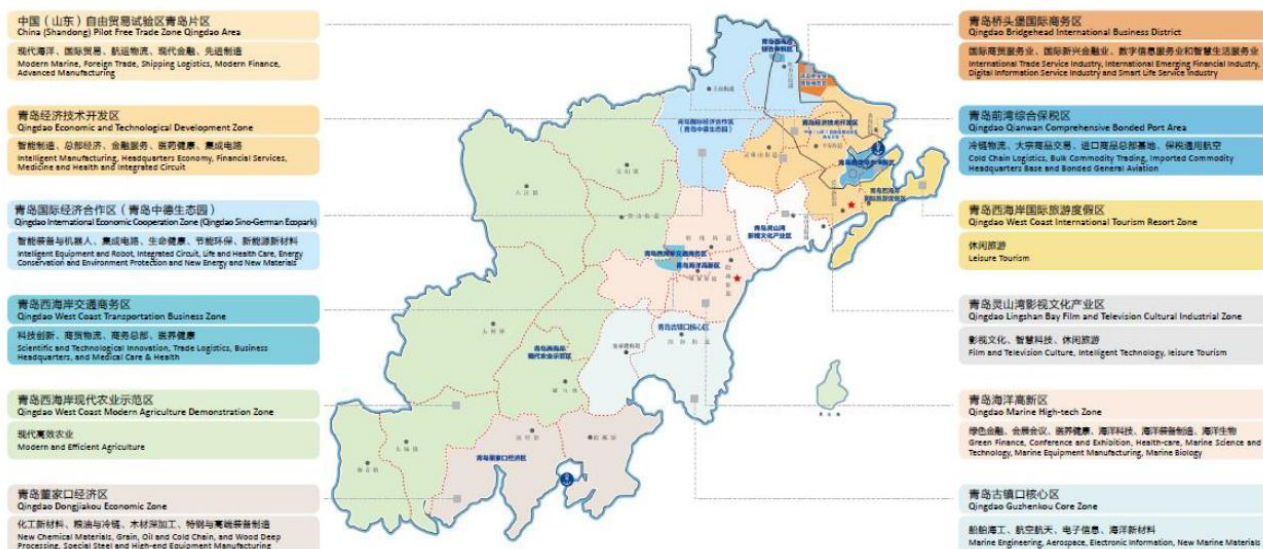
Exhibit 6. Key functional areas of the QDWC New Area